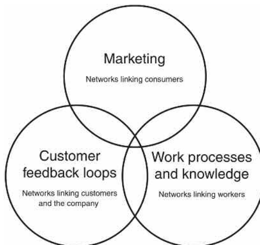
Figure 6-1: A firm's network presence covers three key domains

Companies must build customer feedback loops , that connect them closely with their customers and allow them to enhance the value they offer. Within companies, work processes and knowledge flow through the networks that connect workers. These three key domains to companies' network presence are illustrated in Figure 6-1.